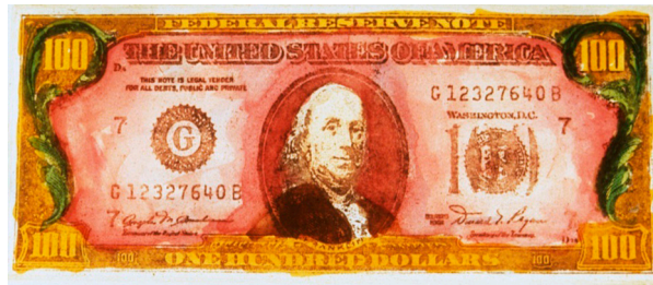
Larry Sommers, US 100, 4"x 8", Handcolored photo etching